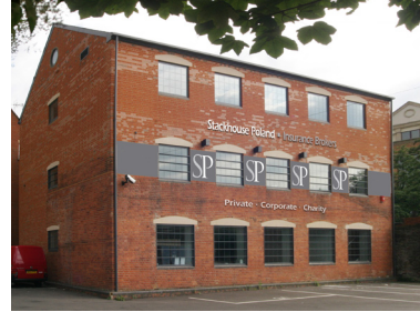
Headquarters in Guildford, Surrey

For further information regarding any of our services other than healthcare please call our head office and ask to speak to one of our private or corporate client managers who will be pleased to assist.